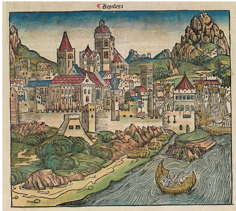
Aquileia, the Roman Empire's metropolis on the Adriatic, on a 1493 German woodcut

Tour Arrangements by Pauwels Travel Bureau Ltd. 95 Dalhousie Street, Brantford, Ontario N3T 2J1 Tel: 519-753-2695/519-756-4900 - Fax: 519-753-6376 tours@pauwelstravel.com – www.pauwelstravel.com