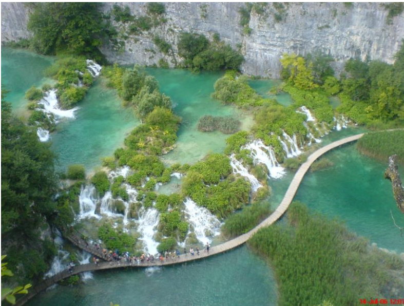
< Scenery in the Plitvice Lakes National Park

Day 3 - Saturday, April 7: A full day of relaxed sightseeing in the Plitvice National Park, including touring by coach and a boat tour, as well as some leisurely hiking, e.g. to view the waterfalls. Dinner again in our hotel.