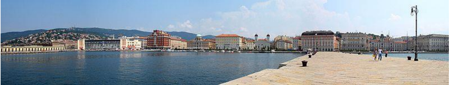
Trieste's glorious waterfront

Day 10 - Saturday, April 14: Sidetrip to the archaeological area and the Patriarchal Basilica of Aquileia , terminus of Antiquity's Amber Road, linking the Adriatic, and the Mediterranean Sea in general, to the Baltic Sea, one of the largest and wealthiest cities of the Roman Empire, destroyed by Attila in the 5th century, another UNESCO site ( http://whc.unesco.org/en/list/825 ). We also visit Udine , the charming capital of Italy's Friuli Province, before returning to Trieste in late afternoon via an area where many battles were fought between Italian and Austrian troops in WW I. No group dinner this evening.