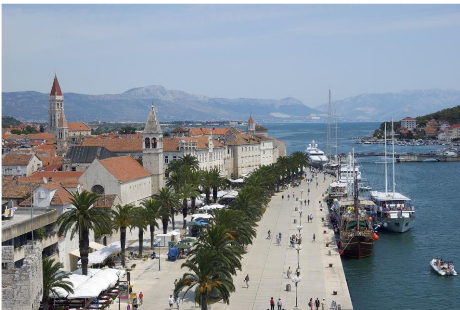
The old town of Trogir

Day 5 - Monday, April 9: Morning tour of historic Sibenik and its fortresses, noble residences, monasteries, and churches. The absolute highlight is the late-medieval Cathedral of St James, a UNESCO World Heritage Site whose architecture and sculptures, a fusion of Gothic and Renaissance architecture and art, reflect influence from Northern Italy and as far away as Tuscany ( http://whc.unesco.org/en/list/963 ). Time for lunch, individual exploring, and shopping before we return to our resort hotel to relax and or enjoy a walk along the beach – and/or a traditional glass of the famous local plum brandy ( šljivovica ) in the bar? - before dinner.