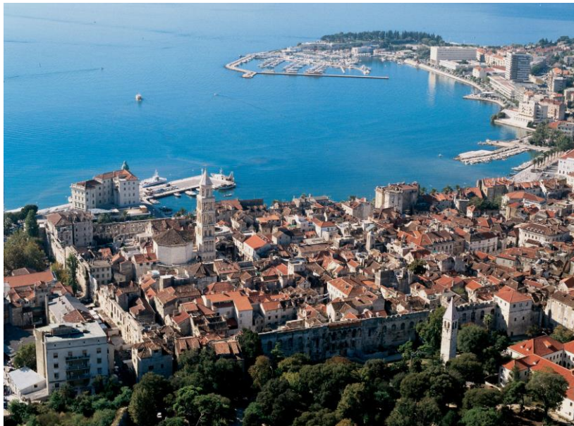
Split in Dalmatia, jewel of Croatia's Adriatic coast

Day 6 - Tuesday, April 10: Full-day excursion to two nearby UNESCO World Heritage Sites. First, Trogir , a quaint coastal community with ancient Greek origins and plenty of medieval, Renaissance, and baroque buildings ( http://whc.unesco.org/en/list/810 ). Second, the ancient city of Split , with its magnificent seafront and ruins of the palace of Roman Emperor Diocletian, built around 300AD ( http://whc.unesco.org/en/list/97 ). Return to Sibenik - along the scenic coastal road . . . if time permits! - and dinner in the hotel.