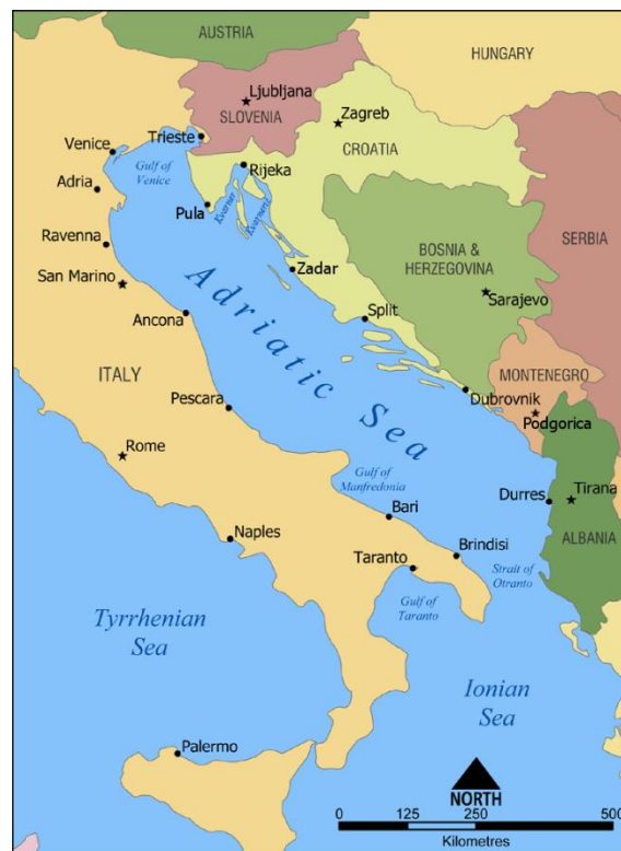
The Adriatic Sea (map c/o Wikimedia Commons)